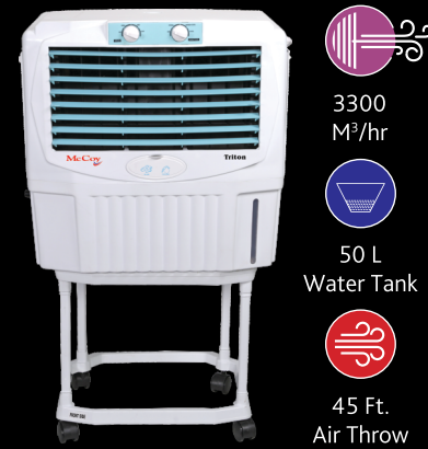
TRITON Trolley Available on Request